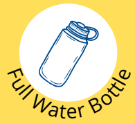
Full Water Bottle